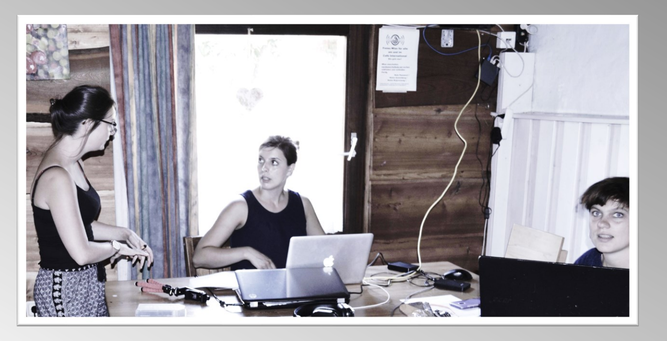
What experience will we gain?